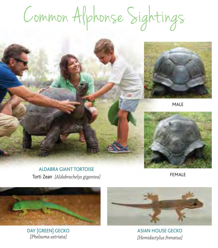
ALDABRA GIANT TORTOISE Torti Zean [ Aldabrachelys gigantea ]

The Alphonse Group The Alphonse Group is situated 400km southwest of Victoria, and is composed of three islands including: Alphonse, situated on Alphonse Atoll in the north, and the small islands of Bijoutier and Saint Francois, situated on St Francois Atoll to the south. Despite the presence of man for around 200 years the atolls retain a rich and varied ecosystem that will amaze and inspire anyone that chooses to explore them. The stunning coral reefs that surround Alphonse and the amazing reef flats, mangroves and lagoons of St Francois will provide endless enjoyment for any nature lover. This guide is intended to help visitors find and identify some of the flora and fauna that abounds in the Alphonse group whilst helping to minimise the potential impact on this special place.