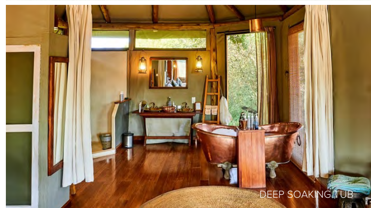
DEEP SOAKING TUB