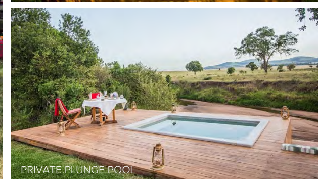
PRIVATE PLUNGE POOL