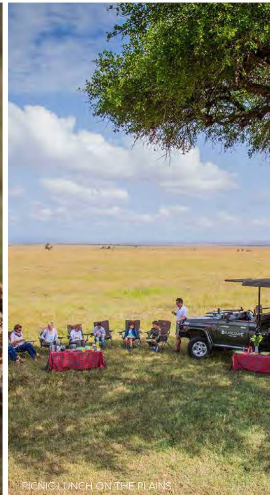
PICNIC LUNCH ON THE PLAINS