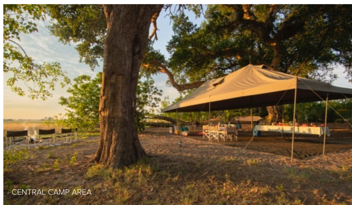
CENTRAL CAMP AREA