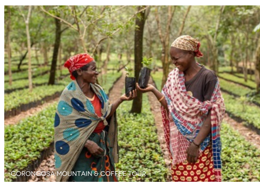
GORONGOSA MOUNTAIN & COFFEE TOUR