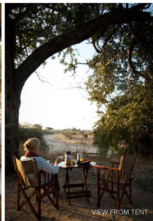
VIEW FROM TENT