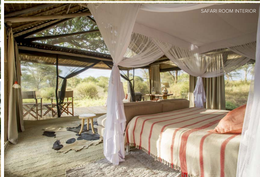
SAFARI ROOM INTERIOR