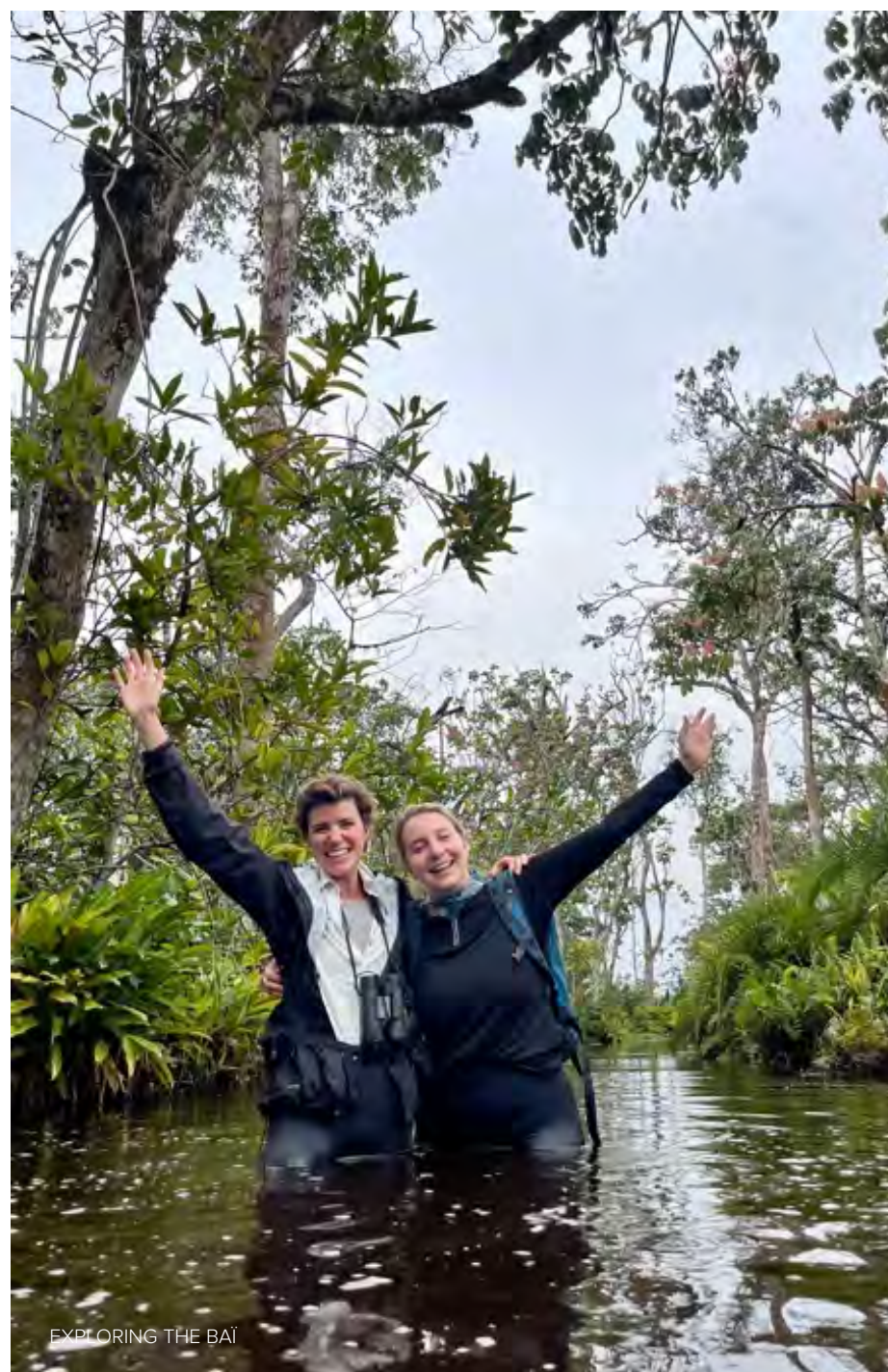
EXPLORING THE BAİ