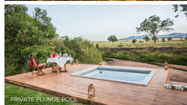
PRIVATE PLUNGE POOL