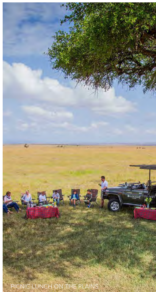
PICNIC LUNCH ON THE PLAINS