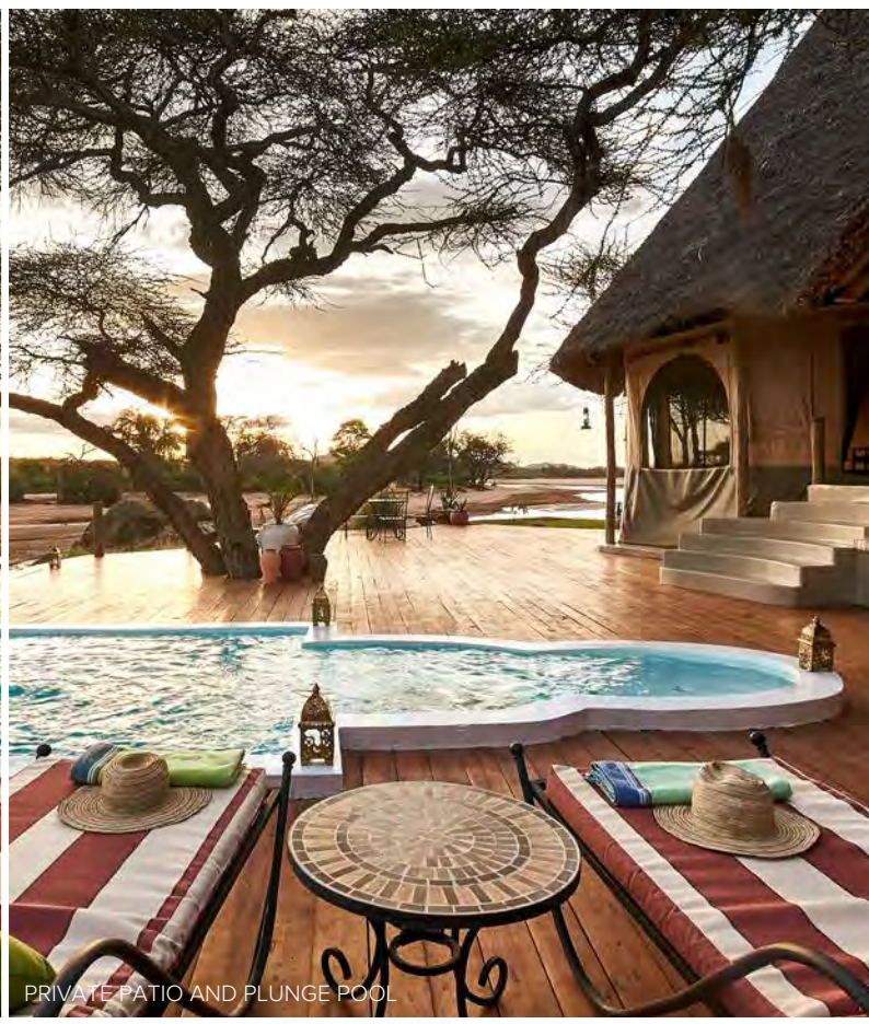
PRIVATE PATIO AND PLUNGE POOL