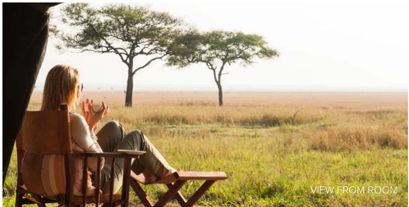
VIEW FROM ROOM