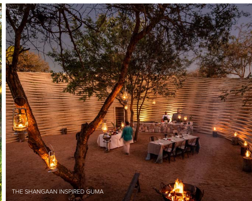
THE SHANGAAN INSPIRED GUMA