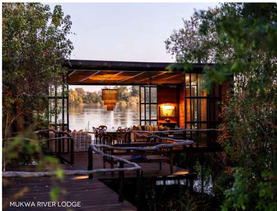
MUKWA RIVER LODGE