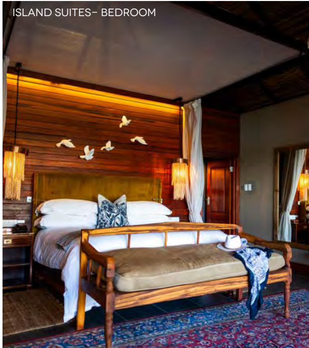
ISLAND SUITES– BEDROOM