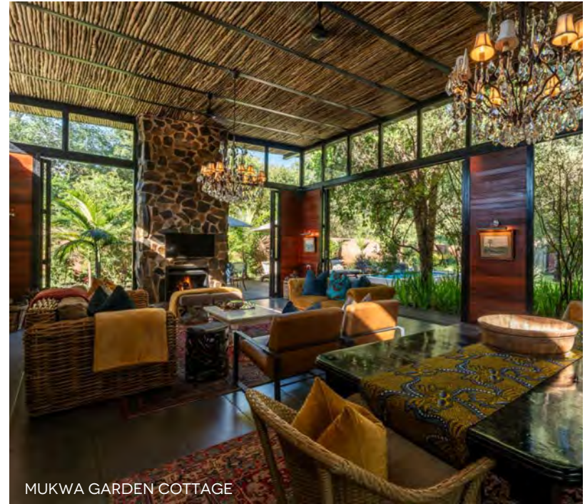
MUKWA GARDEN COTTAGE