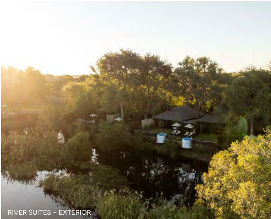
RIVER SUITES – EXTERIOR

MUKWA COTTAGES Available in both two- and three-bedroom configurations, the Mukwa Cottages offer generous indoor and outdoor living spaces, private heated swimming pools, fireplaces and butlers' kitchens. Ideal for families and small groups seeking additional space, privacy and the flexibility of a private home.