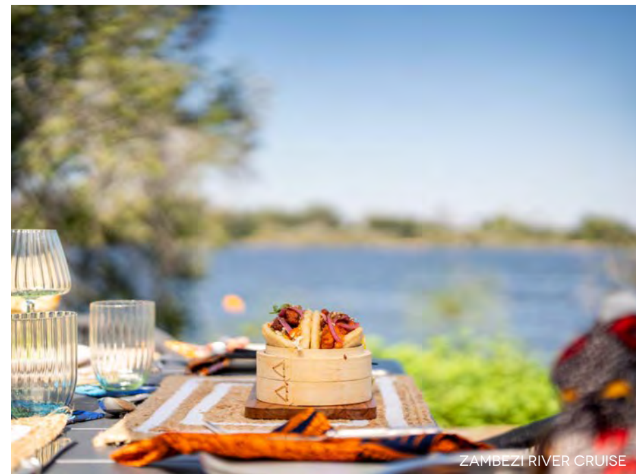
ZAMBEZI RIVER CRUISE