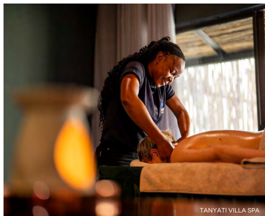
TANYATI VILLA SPA