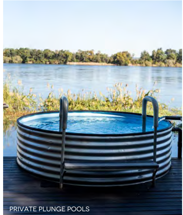
PRIVATE PLUNGE POOLS