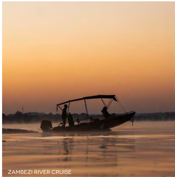
ZAMBEZI RIVER CRUISE

*some parts of the experience are available at an additional cost