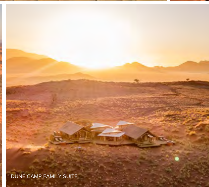
DUNE CAMP FAMILY SUITE