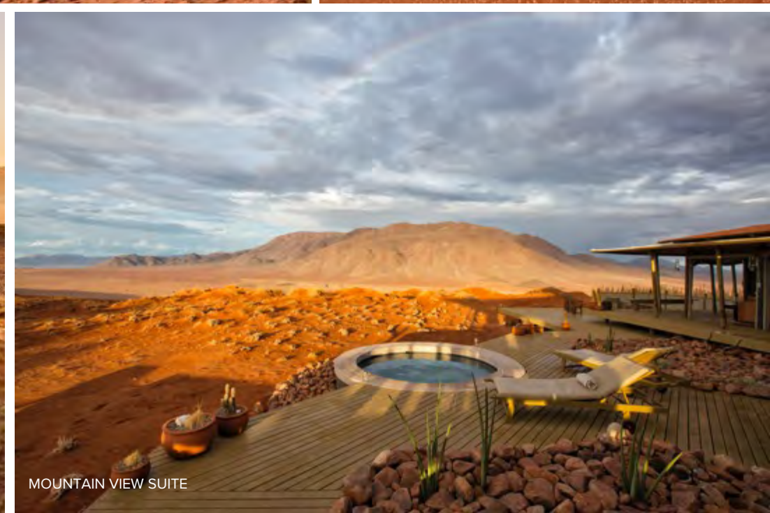
MOUNTAIN VIEW SUITE