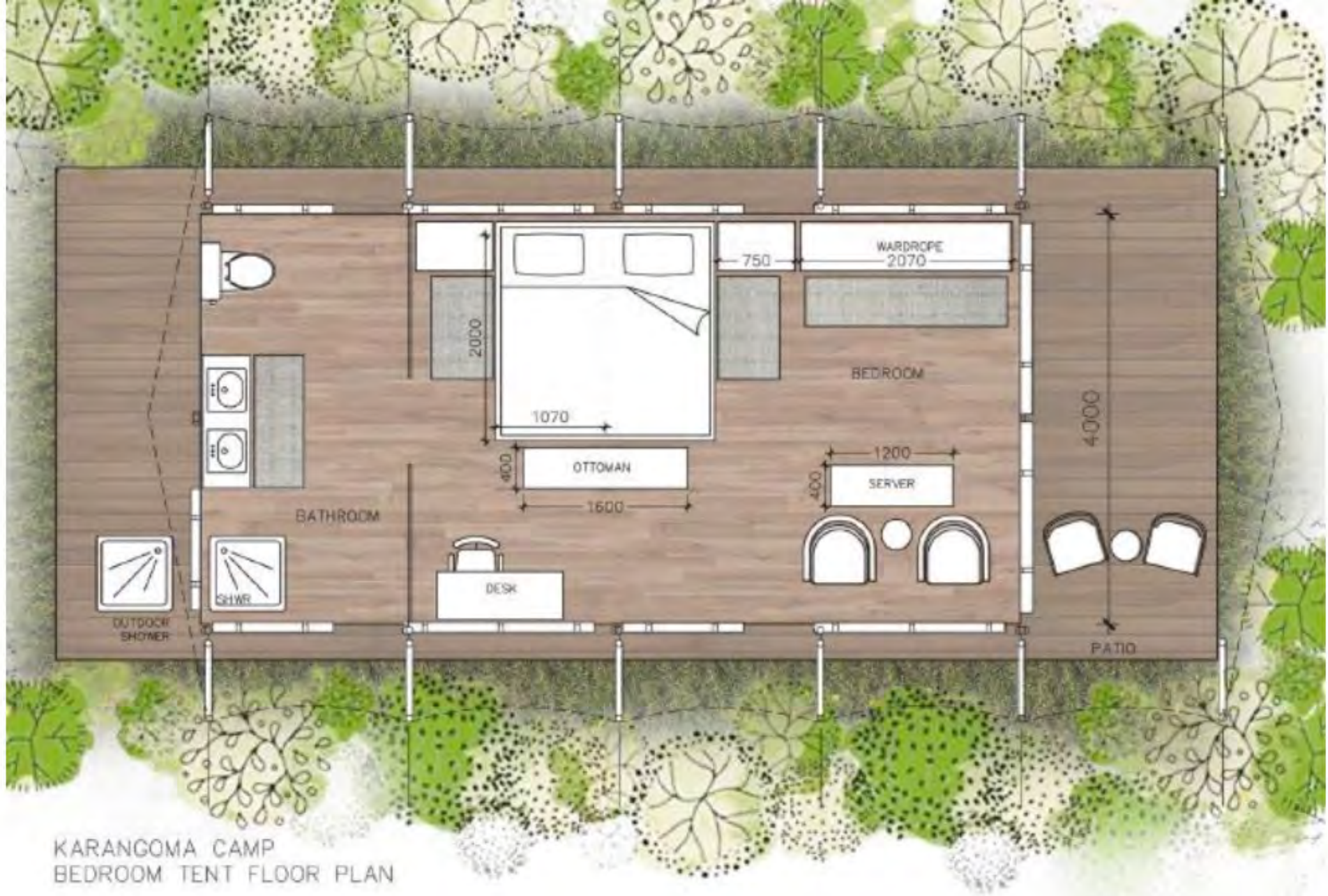
KARANGOMA CAMP BEDROOM TENT FLOOR PLAN