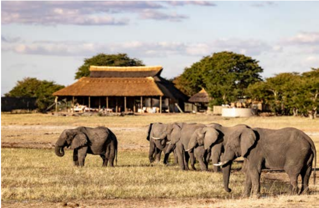
CAMP HWANGE & MUDDY TEAK

This itinerary is prefect for couples or for families with children 8+ years. The rates below are estimates, and exchange rates may fluctuate. Special offers are based on 2026 terms, and T&Cs may vary. You can view all rates on our CRIB SHEET and see the full list of special offers HERE .